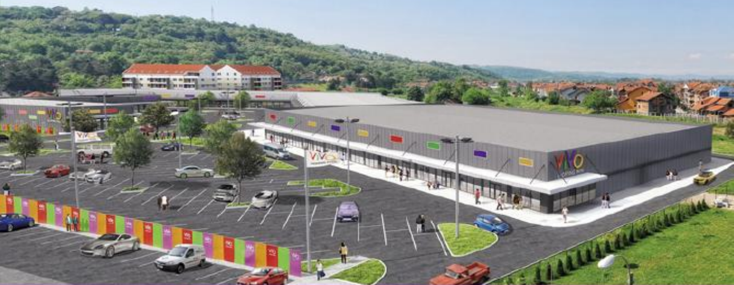
Budući izgled Vivo shopping parka / Future look of Vivo Shopping Park