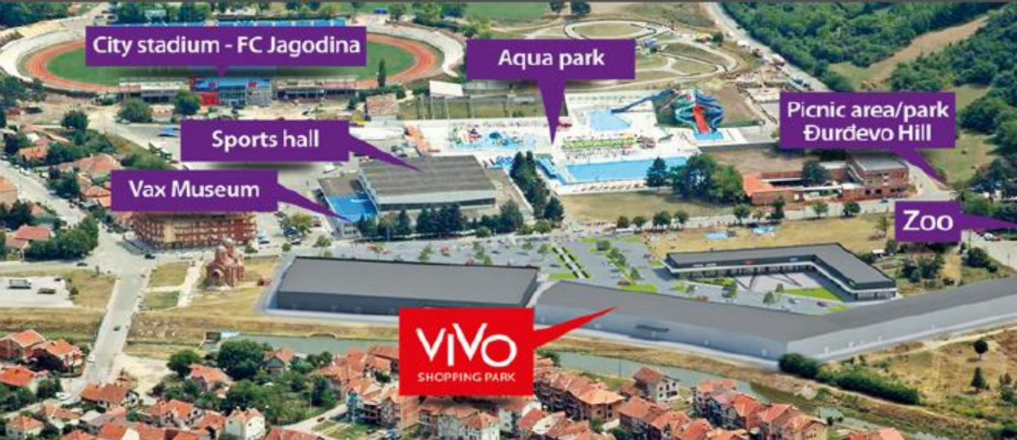
Pogled iz vazduha / Aerial view