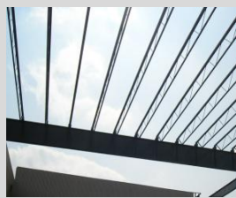
DS CONSTRUCTION LTD

Danos was instructed by the client to undertake the valuation and highest & best use of land and commercial premises of the company. These properties are located in Serbia.